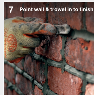
7 Point wall & trowel in to finish