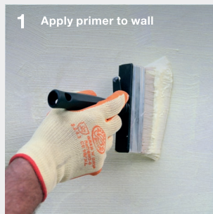
1 Apply primer to wall

Transforming the appearance of internal and external walls has never been easier. Follow our simple seven-step installation guide below to achieve the best results.