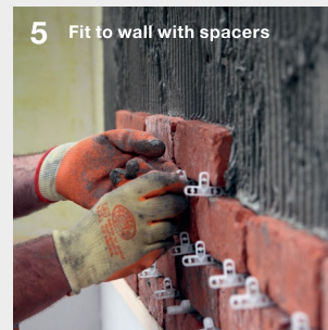
5 Fit to wall with spacers