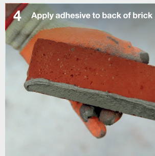
4 Apply adhesive to back of brick