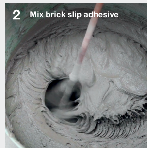
2 Mix brick slip adhesive