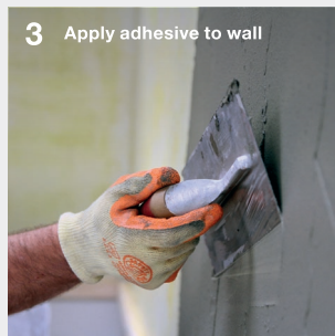
3 Apply adhesive to wall