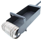
3.1 ltr water per 12.5kg bag